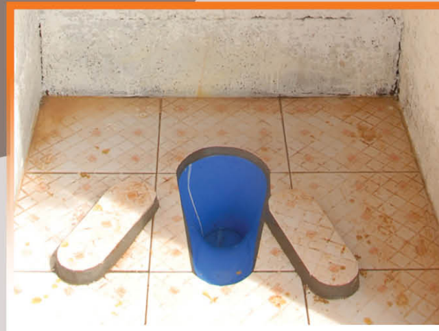
Super DuraSan with SaTo Pan