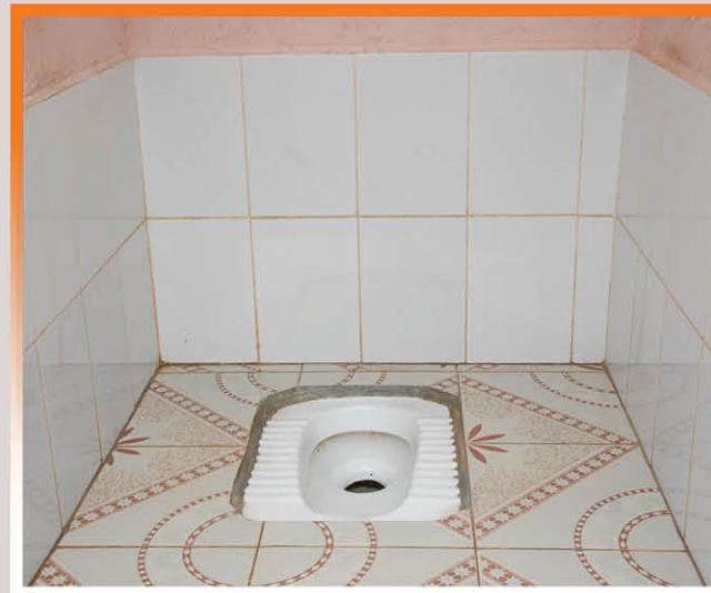
Deluxe DuraSan with Ceramic Pan